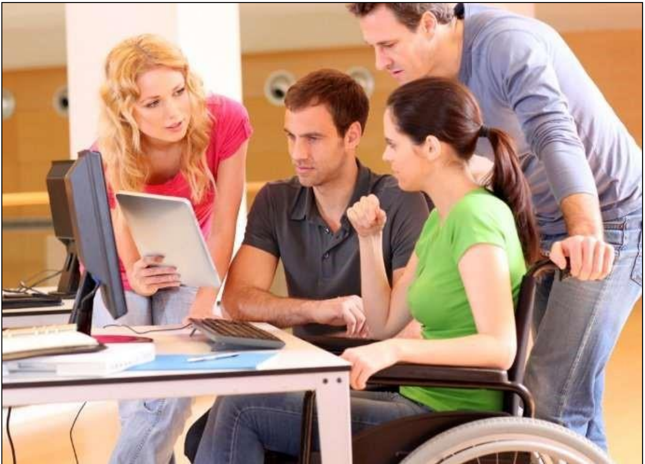
Level 5 Diploma in Education and Training